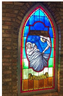
Stained Glass Window from St. Wenceslaus, Bessey, TX

The Saint Peregrine chaplet is made his medal centerpiece and 3 sets of 7 beads (21 beads).